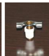
Bleed Valve P/N: CK-011