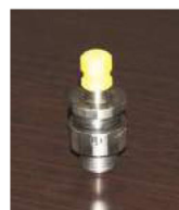
Gas Valve P/N: GV5K-S01