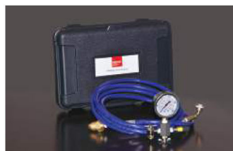
C&G Kit P/N: CKT-0050