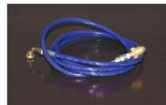
Hose Assembly P/N: CK-014