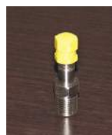
Tank Valve P/N: CK-010