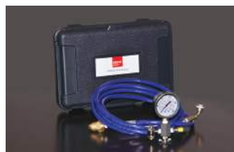
C&G Kit P/N: CKT-0050