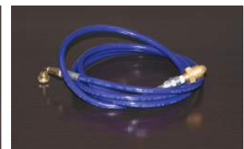
Hose Assembly P/N: CK-014