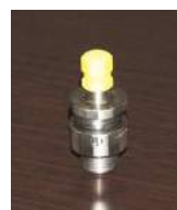
Gas Valve P/N: GV5K-S01